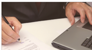
DELIVERING THE TECHNOLOGY AND TOOLS TO KEEP IT SIMPLE

Medical records at the click of a mouse—it doesn't get any simpler than this. Work efficiently with records at your fingertips. From your desk, on the road, or in the court room: Our proprietary software, Excelas , gives you exactly what you need, right when you need it, 24/7, from any location.